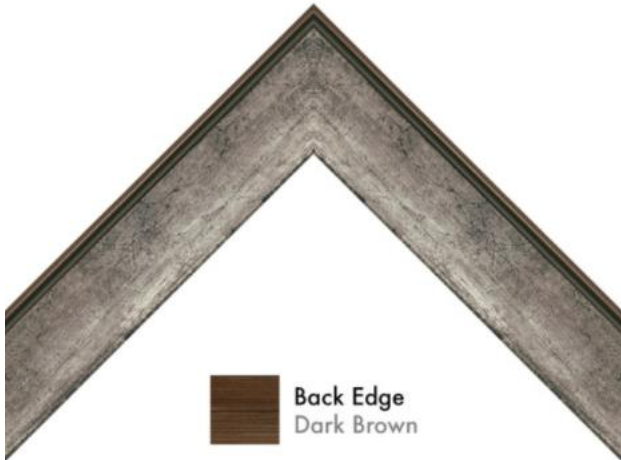
Back Edge Dark Brown